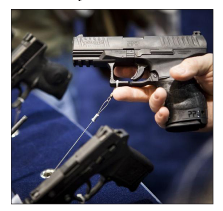
immature argument to make to try and fight the attention they are raising. Churchill's quote is relevant because it is normal for younger generations to desire to create stricter gun laws for

Winston Churchill famously said, "If you're 20 and not a liberal, you have no heart; if you're 40 and not conservative, you have no brain." It is ridiculous to suggest that these students' voices don't matter because they aren't of legal age to vote yet, especially considering they're only one year away. To suggest that they don't have a voice merely because their opinion differs from yours is an